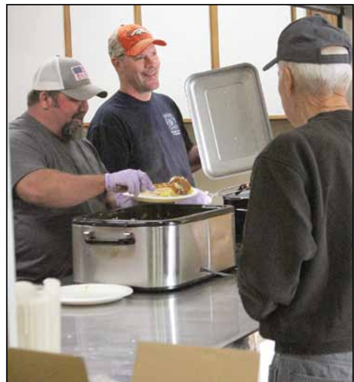
FESTIVAL GOERS fuel up for full day at the Haxtun Volunteer Fire Department's annual pancake breakfast served from 7-9 a.m.

Last year, funds donated at the annual breakfast were used for training and equipment needs, according to Fire Chief Ron Carpenter.