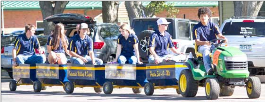
HAXTUN FFA MEMBERS ride the Chapter's Grain Train through last year's parade.

FFA members. For more information on this year's auction, contact Plumb at (970) 774-6111.