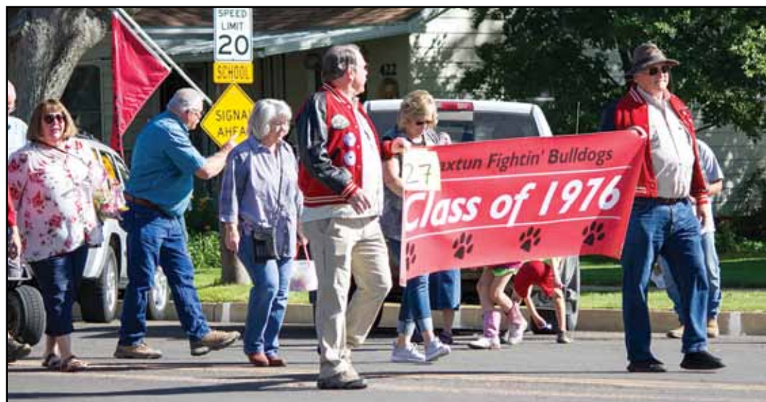
HAXTUN HIGH SCHOOL'S Class of 1976 marches in the 100 th annual Corn Festival parade.